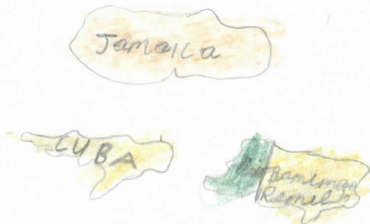
Draw a map that shows Jamaica. It can be any kind of map as long as it includes Jamaica.